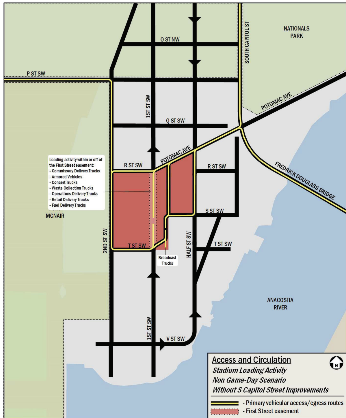
Figure 3: Access and Circulation for Stadium Loading Activity (without South Capitol Street Oval)